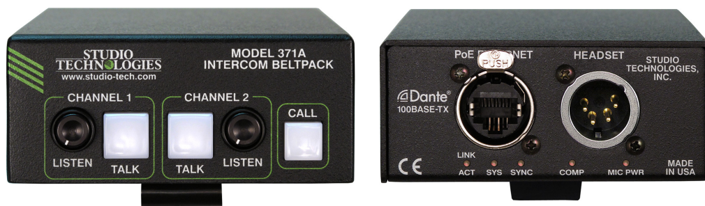
Figure 1. Model 371A Intercom Beltpack top and bottom views

Two bi-color LEDs provide an indication of the Dante connection status. The Dante Controller's Identify command takes on a unique role with the Model 371A. Not only will it cause the talk and call button LEDs to light in a unique highly visible sequence, it can also be configured to turn off any active talk channels.